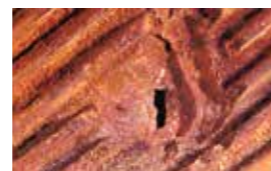
INTERNAL PITTING Caused by an abnormal presence of aggressive elements in water.