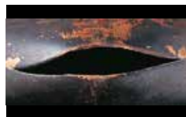
FREEZE RUPTURE Caused by low water flow in the evaporator.