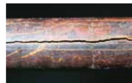
STRESS CRACKING Longitudinal or intergranular cracks caused by high water flow.