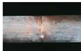
TUBE SUPPORT WEAR Caused by the tube/support contact. Although this phenomenon is quite rare, it must be quickly detected.