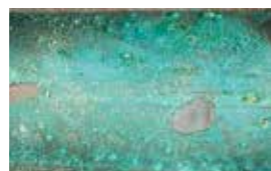
DEPOSIT CORROSION Deposits of algae and slime caused by inadequate water treatment.