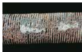
EXTERNAL CORROSION Caused by air intrusion.